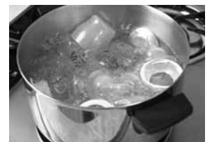
It is important that bottles are thoroughly cleaned; the safest practice for the first three months of a baby's life is to routinely boil bottles and bottle parts.

The safest practice during the first 3 months of life is to boil bottles and bottle parts. This is especially true when the water quality is questionable. Some physicians might tell parents to simply wash bottles in hot, soapy water or in the dishwasher, as this may be adequate for healthy newborns in many situations. Still, WIC advises participants to boil bottles since this is the best method for killing bacteria.