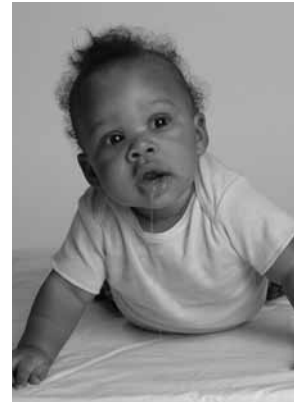
Signs of GERD may include drooling.

Common infant problems: Spitting up. 2011. Texas Department of Health. Stock no. 13-128.