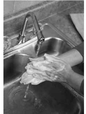
Wash hands thoroughly with soap and warm water.

Another key factor in formula preparation is proper dilution. It is very important to mix the liquid concentrate or powdered formula with the right amount of water. Adding either too much or not enough water can lead to serious health problems for the infant. Only a physician should prescribe a dilution or recipe that is different from the manufacturer's directions.