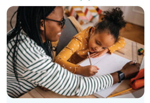
Talk less about how your child looks and more about what makes them special. Praise their artistic skills, bravery, humor and kindness.

Help your child build confidence and accept their body, no matter their size.