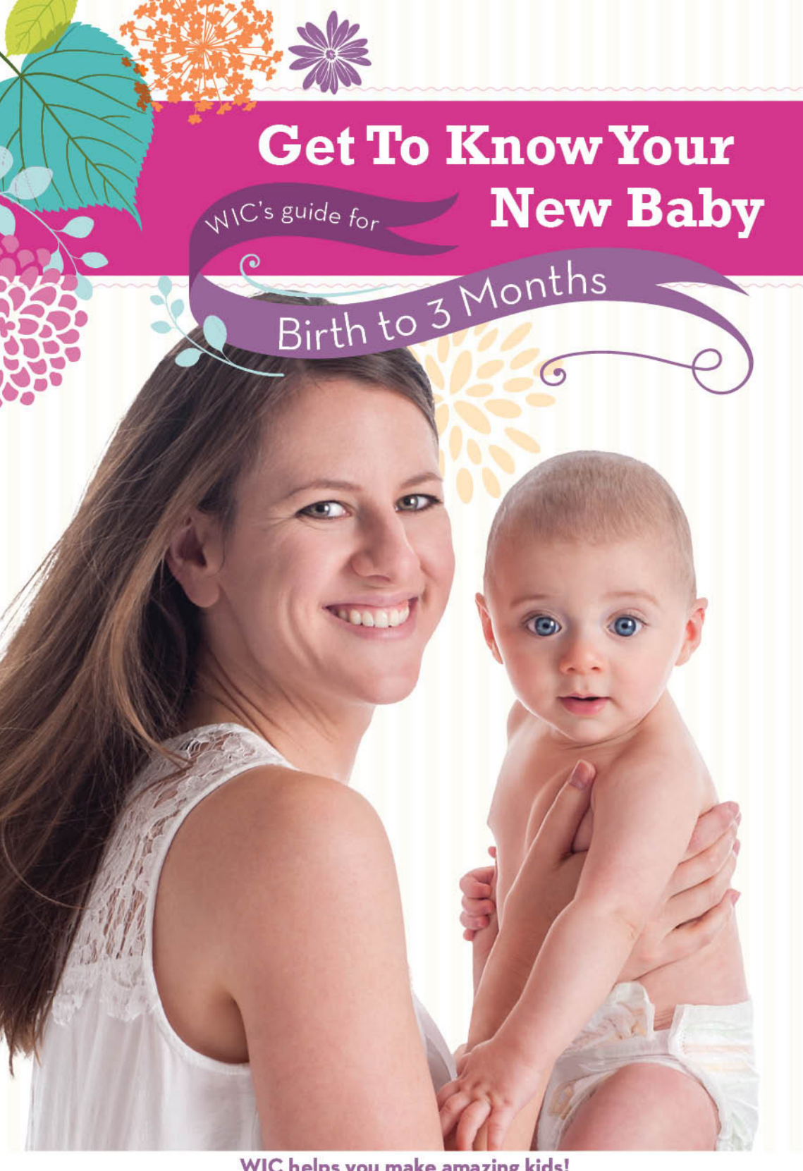
WIC helps you make amazing kids!